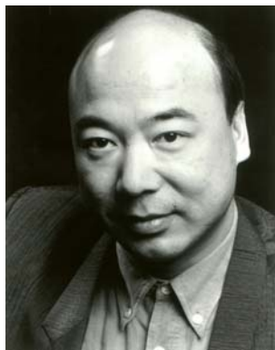
Dr. Zhou Long

He is the recipient of the 2003 Academy Award in Music , a lifetime achievement award from the American Academy of Arts and Letters.